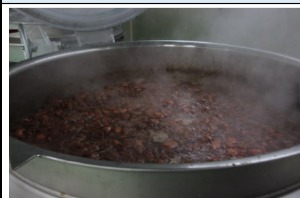
Boiling cod roe