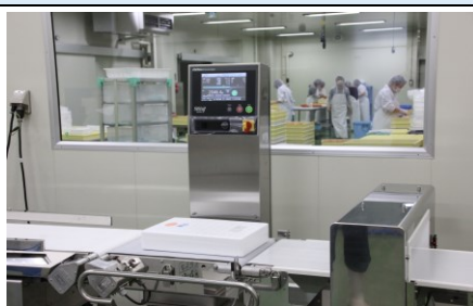
Metal detector / weight checker guarantees the quality.